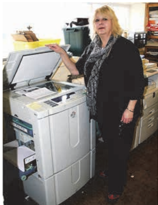
Printing Beach News 2010

Jacqui was also keen to continue providing our community with Beach News, our village magazine. In the days before the magazine was