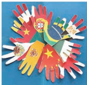
Guiding hands – 1 st Waterbeach Guides learning about Guiding around the World

Together with others from our Guiding county – Cambridgeshire East – we celebrated our World Thinking Day together virtually for the first time ever on our brand new Cambs East Guides YouTube channel. There