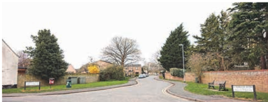
Waddelow Road, Waterbeach - 2021

Whilst none of these big changes could have happened due the sole efforts