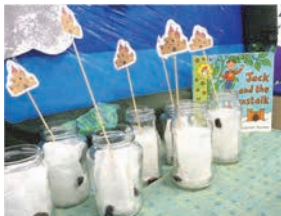
Jack and the Beanstalk experiment

Since we've moved in, the children and staff team have settled in well to our new surroundings. It's been great to see the children exploring the larger indoor and outdoor space, creating some fantastic creations and art work to decorate the play space, and getting to grips with our new balance bikes in the garden. The children have also enjoyed finding out about Chinese New Year, as we created some paper lanterns, trying to use some chopsticks