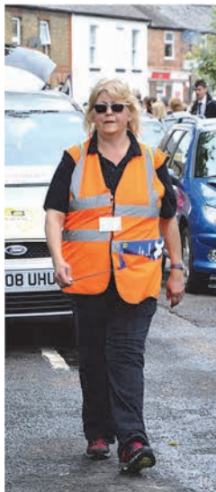
Leading Feast Parade 2015

professionally printed Jacqui would spend many hours in the evenings printing the copies ready to be collated and folded by